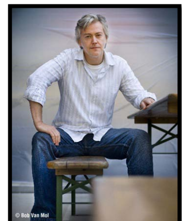
Wim Henderickx 6

As resident composer at Muziektheater Transparant, he has been creating operas and musical theater works for over a decade. Between 2004 and 2010 he worked on his TANTRIC CYCLE, a seven part composition series with the East as its source of inspiration. MEDEA – a music theater production commissioned by Muziektheater Transparant, HERMESensemble and Veenfabriek – toured across Flanders and the Netherlands in 2011-2012 with Wim Henderickx assuming the role of conductor. This production will be performed internationally in 2013. The National Orchestra of Belgium performed his SYMPHONY nr. 1 (At the Edge of the World) in Luxembourg and Brussels on 1 and 2 March 2012. Next to the many recordings that include his work, two full CD's with his own music appeared in 2011. 'Disappearing in Light' was recorded with HERMESensemble with Henderickx himself at the head. 'Tejas and other orchestral works' was recorded with deFilharmonie, conducted by Martyn Brabbins. Info: www.wimhenderickx.com